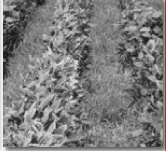
Premature yellow and stunted plants.